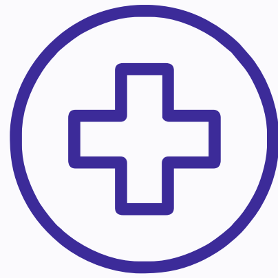
Healthcare & Pharma

High Quality Products For Various Industrial Domains